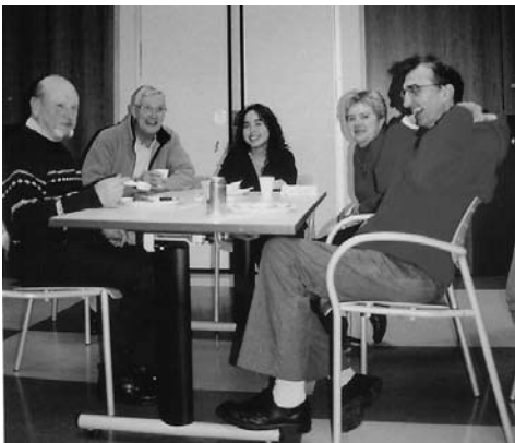
Celebrating the end of term at the Keshen Goodman Public Library Winter Party

Another time I was in line at a car dealer, waiting for an oil change. I was fifth in line and was drinking a cup of coffee, just looking around at the different bays. I was really reading the signs. Then I shook my head. I had tears in my eyes. I was excited. Time is creeping up on me. I hope I can fulfill my dreams of getting a GED someday so I can be a tutor and help someone just like me.